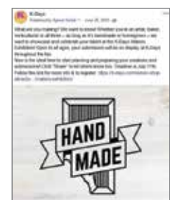
Social media mentions